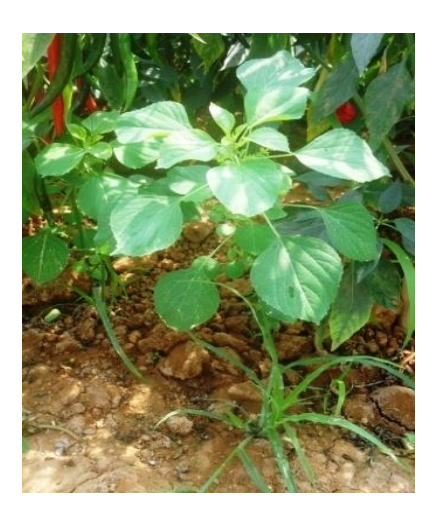
Figure 1: Legend for figure 1