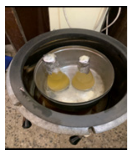
Fig. 2. Preparation of Media

The Result showed that tobacco leaves could inhibit the growth of Aeromonas hydrophila and E. coli . The study was conducted in replicates. Fresh cultures of respective pathogens were streaked over the surface of Mueller Hinton agar plates. 1 mg/ml extract was filled up of each well and well with solvent used as a negative effect. The plates were incubated at 37°C for 24 hours the results of the present study indicated antibacterial