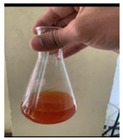
Fig. 1. Preparation of Extract

3.8 gm of Mueller Hinton Agar (MHA) powder diluted in 100ml of distilled water. Dissolve