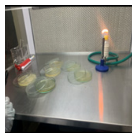
Fig. 3. Preparation of petriplates

leaves has great antimicrobial activity<sup>4</sup>. According to Sofi Mohmmad Ashaq et al 2022 Organic solvents such as methanol, ethanol, acetone has bioactive compound<sup>5</sup>. The Present study exhibited