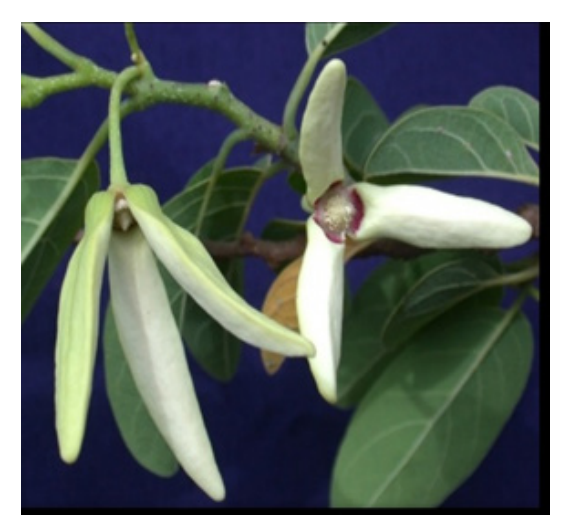
Fig. 3. Annona squamosa L. flowers

several secondary metabolites such flavonoids and phenol..<sup>29</sup> Table 1.3 showing anticancer activity of Annona squamosa L.