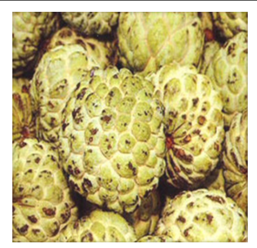
Fig. 2. Annona squamosa L. Fruits