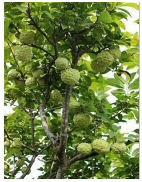
Fig. 5. Annona squamosa L. Plant

and microcirculation was evaluated for three plants where Rosmarinus officinalis , and Annona squamosa L. showed reduction of lipid accumulation whereas Rosmarinus officinalis showed inhibition in platelet aggregation and