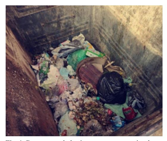
Fig. 1. Desegregated plastic wastes pose a major threat