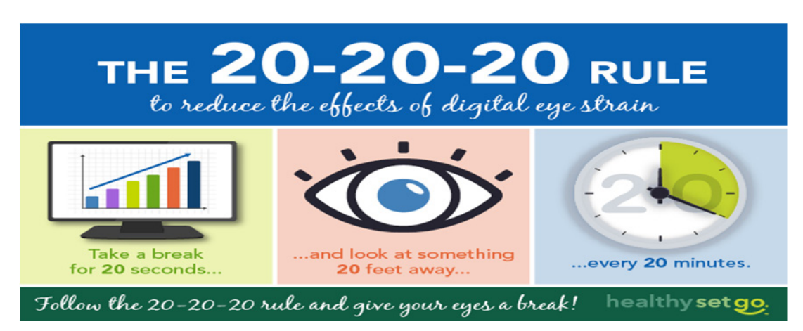
Fig. 2. Strategy to prevent Digital Eye Strain

experience some delay in progression of the disease with multivitamin antioxidant vitamin and mineral supplementation over a period of 6 month to five years. Zinc as an indispensable antioxidant proves potent in prevention of AMD, cataract and diabetic retinopathy too. In animal models Retinal ganglion (nerve) cell death induced retinal dysfunction has been counteracted by supplementation with spearmint extract, forskolin, B vitamins and homotaurine.<sup>9</sup> Nevertheless, any natural food with the antioxidant, anti-inflammatory and antiapoptopic properties have proven to prevent nerve cell degeneration and improve visual health.<sup>10</sup>