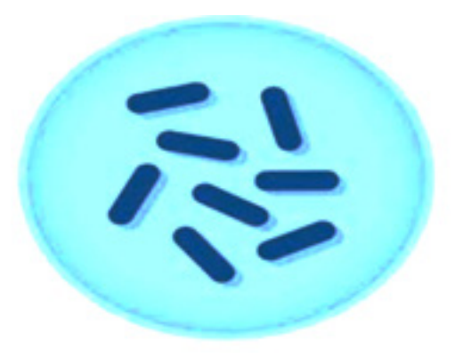
Fig. 4. Enterobacter Species