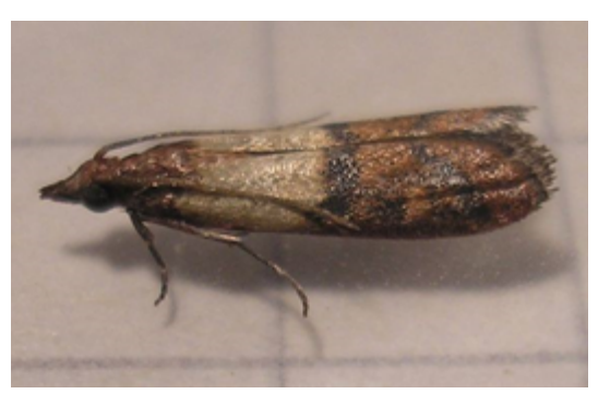
Fig. 15. Plodia interpunctella