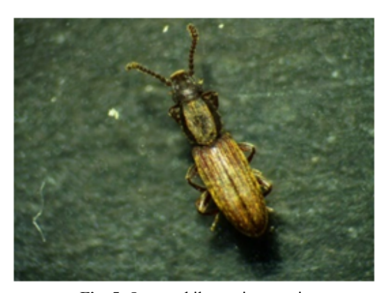
Fig. 5. Oryzaephilus surinamensis