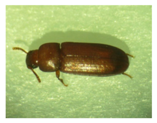
Fig. 2. Tribolium castaneum

Commodities/Products/Host Record: These were recorded on stored products like, wheat