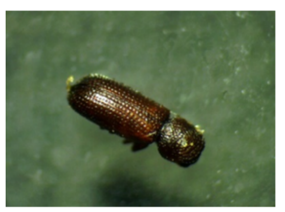
Fig. 4. Rhyzopertha dominica