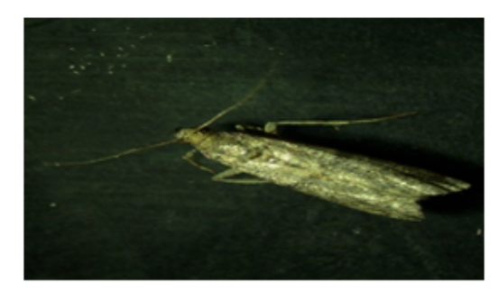
Fig. 17. Ephestia cautella