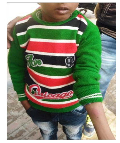
Fig. 1. Child with positive Tuberculin Skin Test

were normal in all four limbs. The respiratory and cardiac examinations were normal except for a slight decrease in air entry on left side of the chest. The child was then subjected to further work up. The CBC report, fundus and visual acquity test were WNL.Mntx was strongly positive with induration