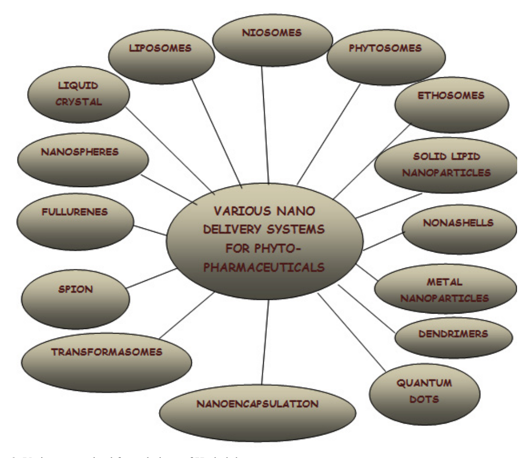
Fig. 3. Various nanosized formulations of Herbal drugs