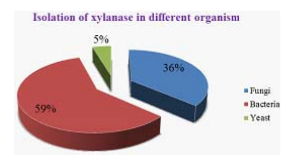
Fig. 2. Pie chart depicting the total microorganism that produces xylanase