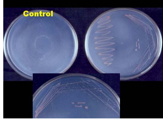
Plate 4: Growth of Methylobacterium in Methanol Peptone Agar