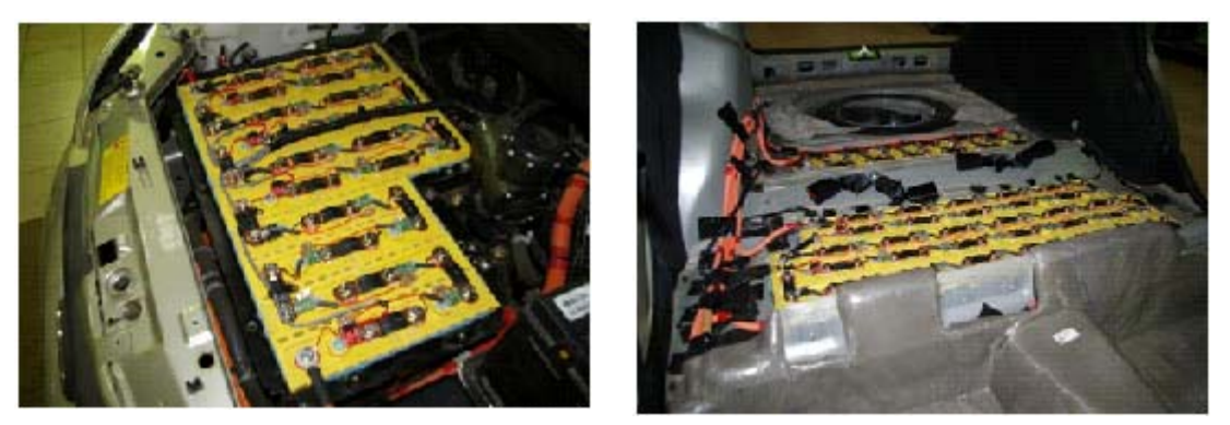
Fig.2. a) the first block of accumulator cells; b) position of the second and the third blocks of accumulator cells

An engine-generator unit increasing the electric vehicles driving range without rigid kinematic connection with the vehicles driving axle and globally known as the "Range Extender" was