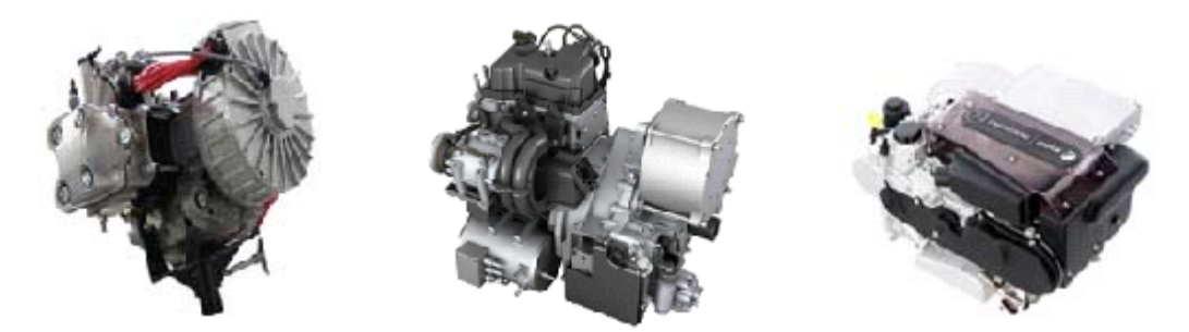
Fig. 3. Examples of Range Extender units