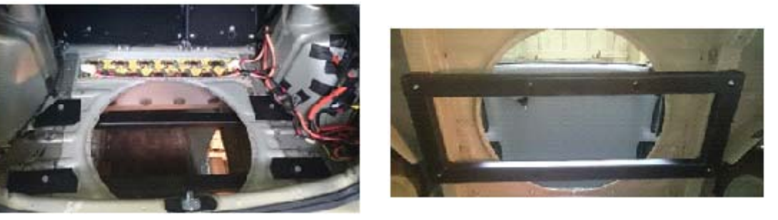
Fig. 6. Mounting of the subframe to the load-bearing elements of the body