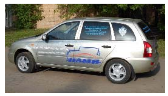
Fig.1. Electromobile VAZ 1817 ELLADA

This is a small class vehicle developed on the basis of a serial model of VAZ 1117 KALINA, with the station wagon body type. As the traction engine, this vehicle has an asynchronous electric machine with the liquid cooling, located in an engine compartment in the front part of a body, transversely to the longitudinal axle of the vehicle. The front traction wheels drive is performed by electric machine via the two-stage cylindrical constant mesh reducer which is the final drive with rigid kinematic connection via a differential with traction wheels' hubs by means of two drive shafts