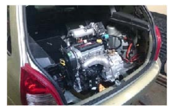
Fig. 5. Position of the Range Extender in the vehicle

In order to analyze the composition of electronic and electric components of the basic