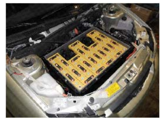
Fig. 8. Electric energy storage system in the underhood space of the vehicle's experimental prototype

vehicle, its partial dismantling was performed. The traction electric three-stage asynchronous engine transfers the torque to the traction wheels by means of the two-step cylindrical constant mesh reducer, which is the final drive. The engine's nominal capacity amounts to 30kW, maximum torque – 240 \text{ N} \cdot \text{m}