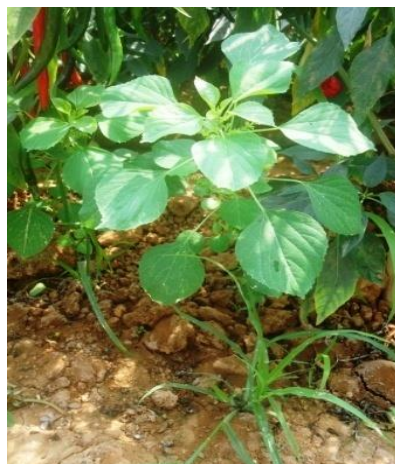
Figure 1: Legend for figure 1