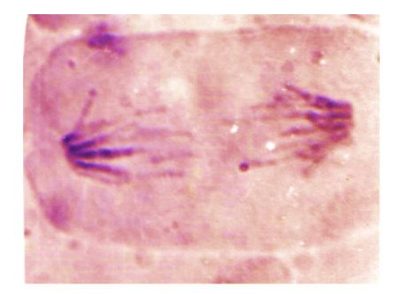
Fig. 3. Showing Normal Anaphase