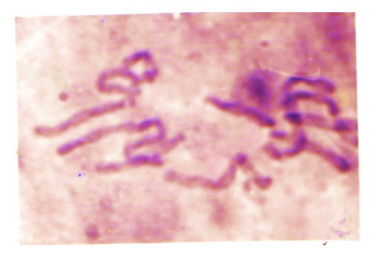
Fig. 3. Showing Scattered Chromosomes at Metaphase