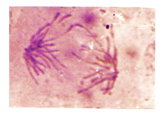
Fig. 4. Showing Chromatin Bridges at Anaphase