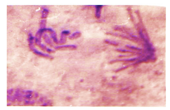
Fig. 6. Showing Lagging Chromosomes at Telophase