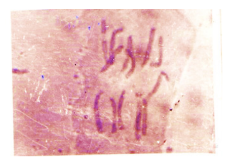
Fig. 2. Showing Normal Metaphase