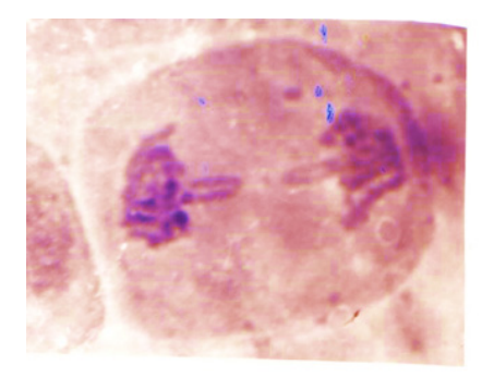
Fig. 4. Showing Normal Telophase