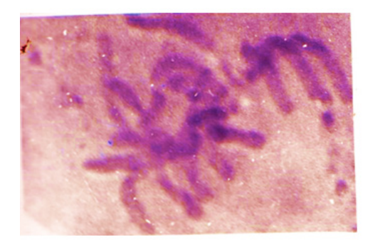
Fig. 2. Showing Sticky Chromosomes on Equator at Metaphase