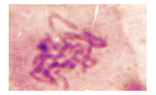
Fig. 1. Showing Sticky Chromatids at Prophase

Plate 2. (Chromosomal Abnormalities After The Treatment of Heeng)