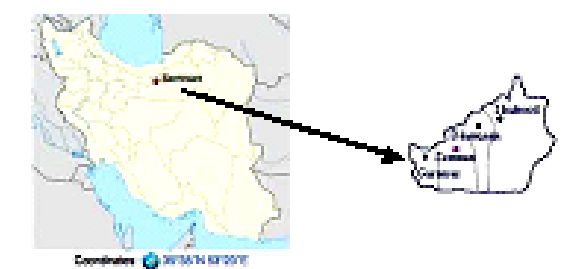
Fig. 1. Study site in Garmsar district, Semnan Province, Iran

In order to perform simulation studies, SWAP model was calibrated using crop parameters to achieve potential yields of regional crops. To verify the validity of model for some of the crops, the measured actual yield of some crops for periods of 1998–2007 of Garmsar region were collected and were compared with the model simulated data. To evaluate the level of difference between