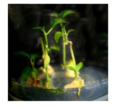
c) 35 day's old regeneration

Fig. 3: Chilli Hypocotyl as explants on regeneration medium 3.0mg/IAgNO<sub>3</sub> +5.0mg/I BAP +2.0mg/I 2,4D