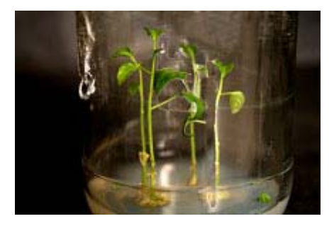
c) 35 day's old regeneration