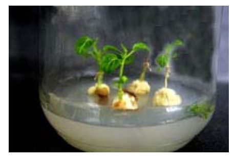
b) 25 day's old regeneration