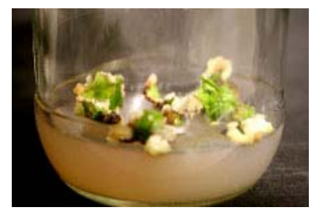
c) 35 day's old regeneration