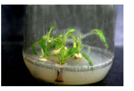
a) 15 day's old regeneration