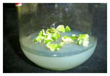
b) 25 day's old regeneration