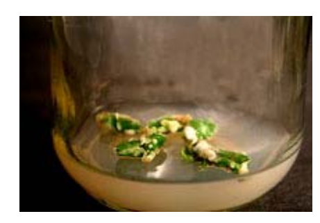
b) 25 day's old regeneration