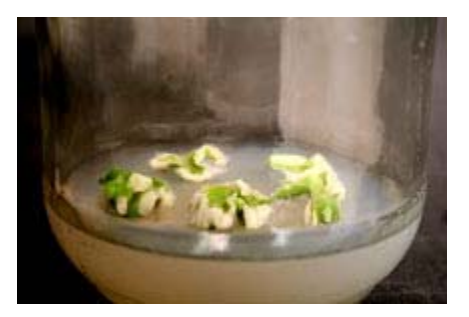
a) 15 day's old regeneration