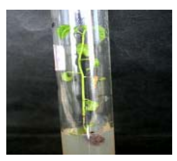
d) 40 day's old regeneration

Fig. 3: Chilli Epiocotyl as explants on regeneration medium 3.0mg/IAgNO<sub>3</sub>+5.0mg/I BAP +2.0mg/I 2,4D