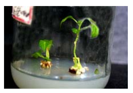
b) 25 day's old regeneration

Fig. 3: Chilli Epiocotyl as explants on regeneration medium 3.0mg/IAgNO<sub>3</sub>+5.0mg/I BAP +2.0mg/I 2,4D