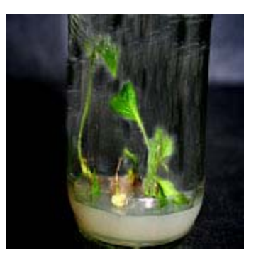
d) 40 day's old regeneration