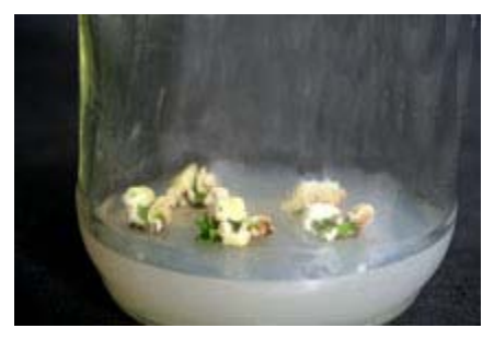
d) 40 day's old regeneration