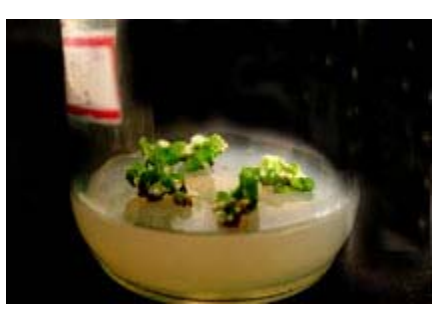
c) 35 day's old regeneration

Fig. 2: Chilli Leaf Disc as explants on regeneration medium 3.0mg/IAgNO<sub>3</sub>+5.0mg/I BAP +2.0mg/I 2,4D